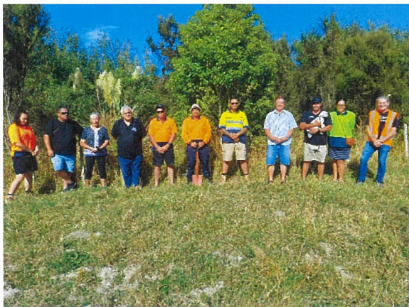
He Kāhui Wairarapa - Staff and Trainees join PK Trustees for the site blessing.