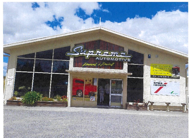
Supreme Automotive – Updated the frontage and reception area early 2024.