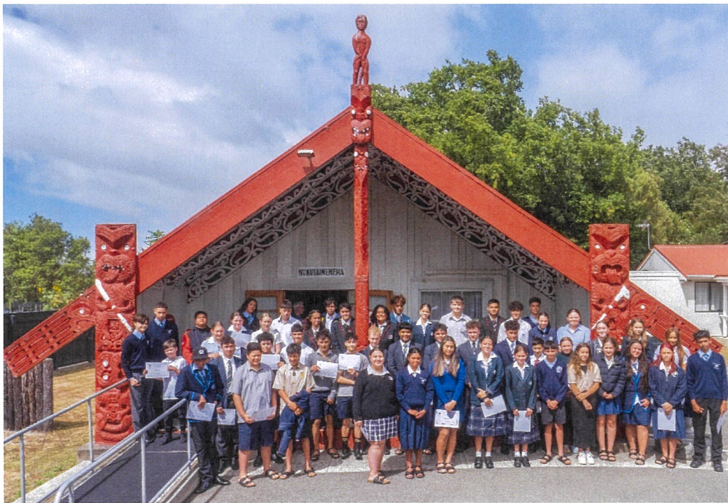
Annual Scholarship Awards January 2024