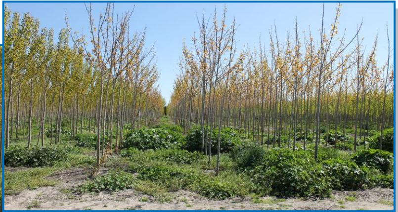
Masterton Rural, Akura 2