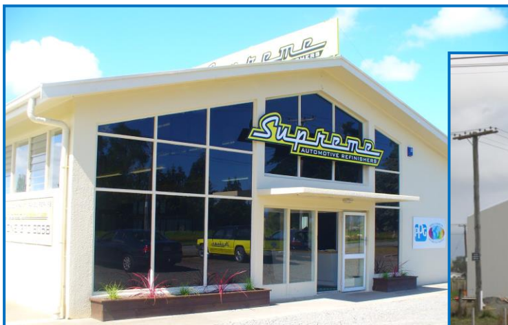
Masterton Industrial, Supreme Automotive