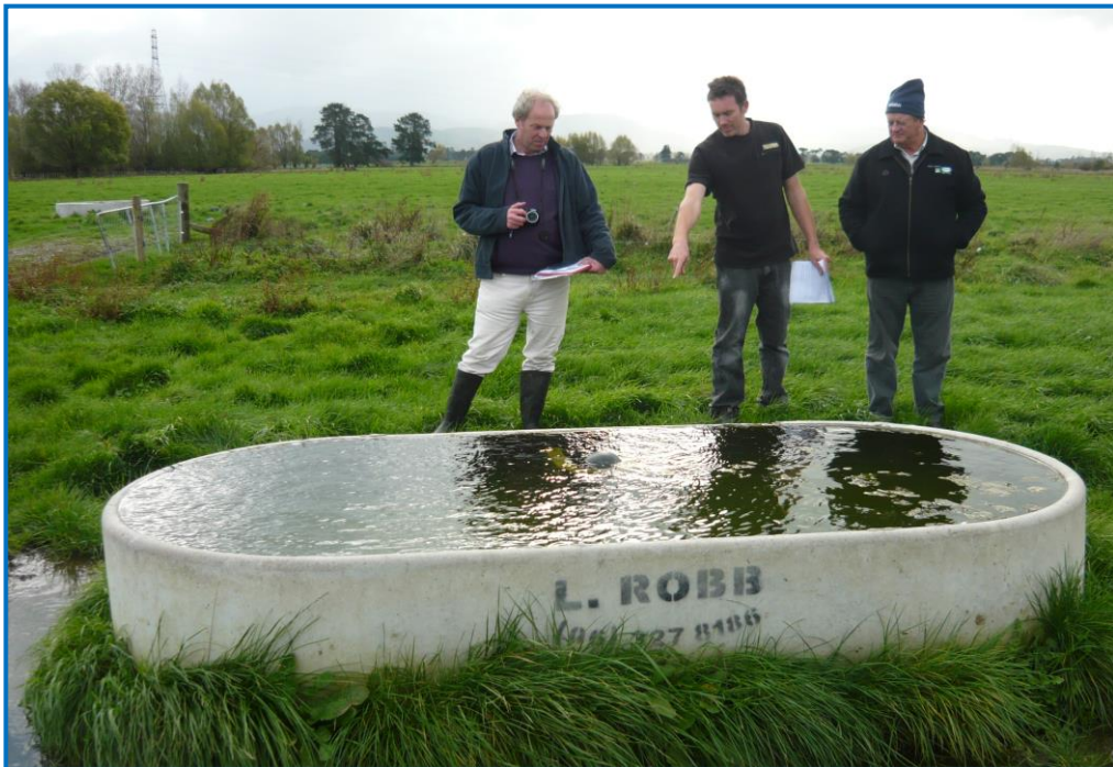
Farm Inspection Hikurangi Farm Carterton, 2015