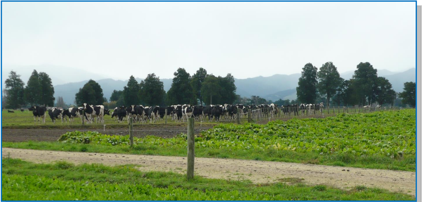
Farm Inspection Papawai Farm Greytown, 2015