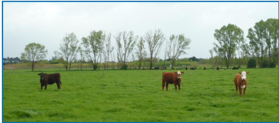
Masterton Rural, Akura 1