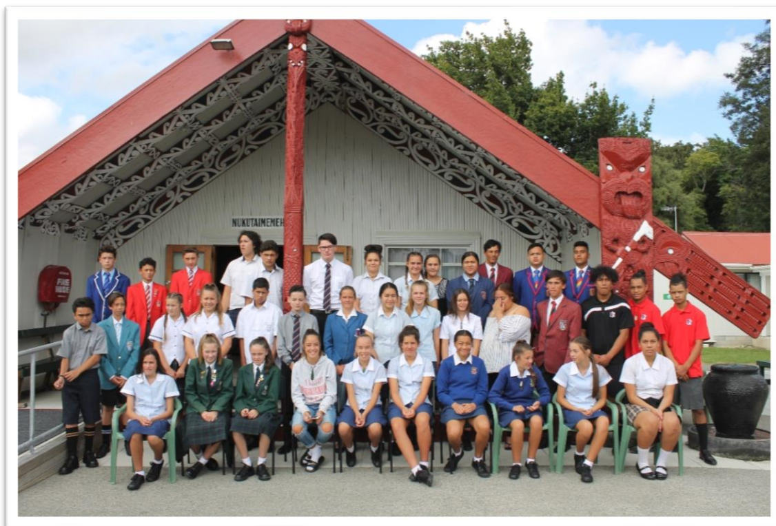
Annual Awards Hui 2018