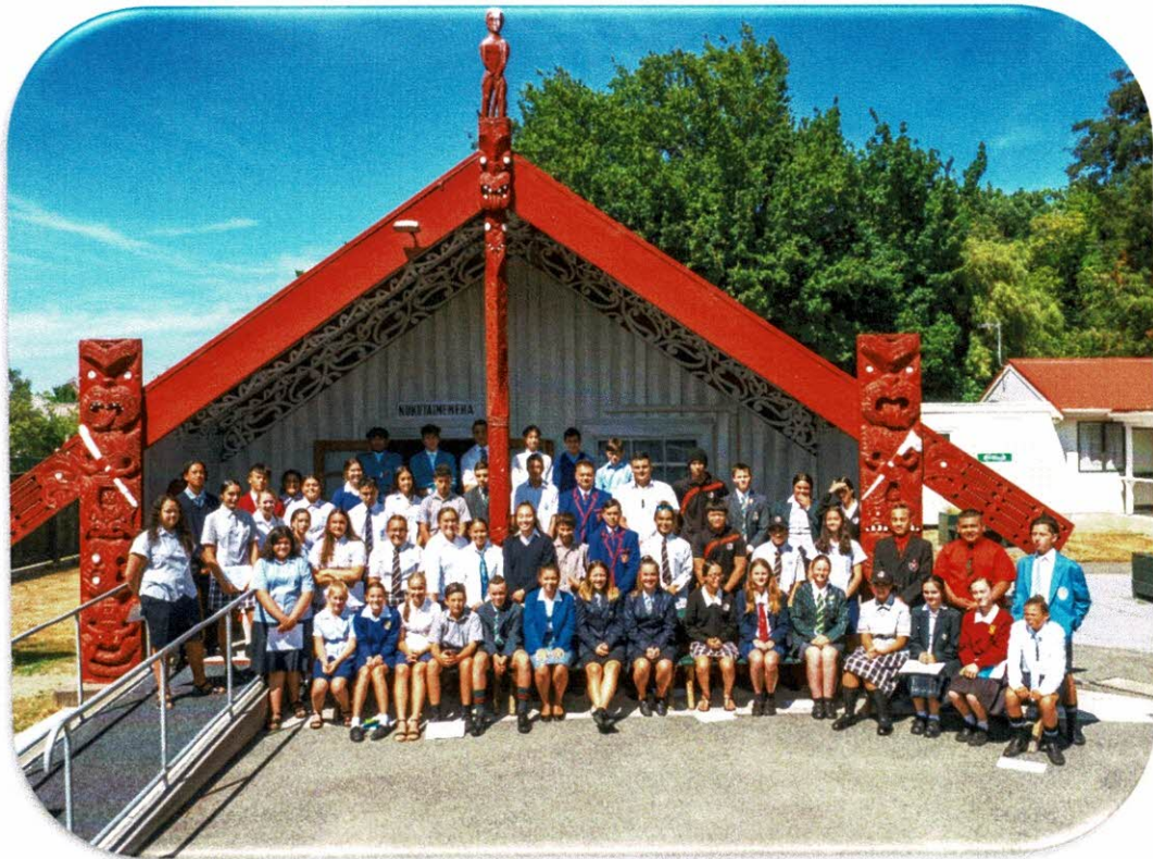
Annual Awards Hui 2020