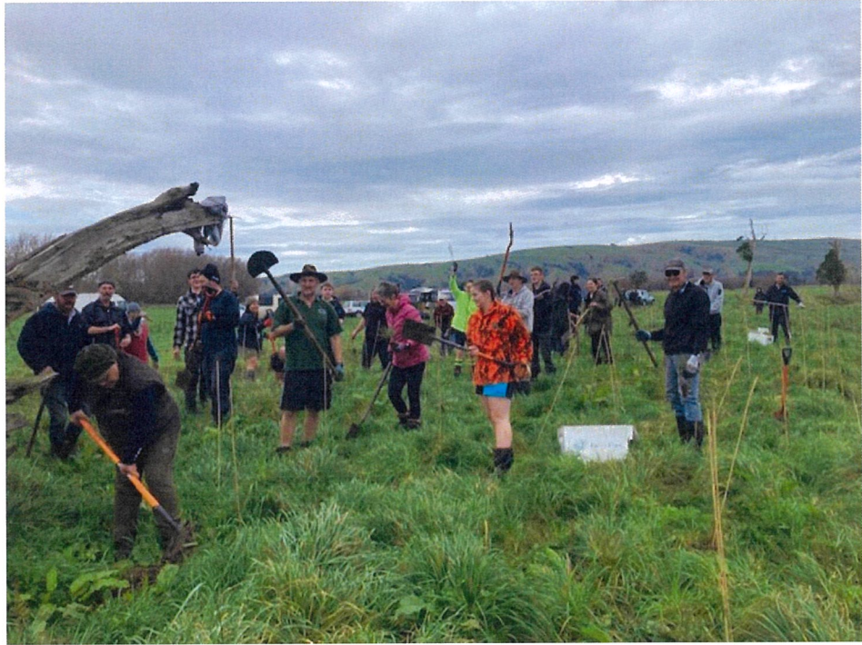
Tree Planting Papawai Farm June 2022